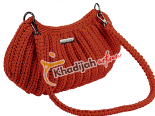
Sofea Sling Bag

Hand-crocheted in vibrant tones, this sling bag combines charm and practicality. Each piece is crafted in various colors, making it a stylish everyday companion.